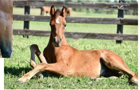
Pictured above are some of the MSU Horse Teaching and Research Center's 2020 foals. Look out for these foals as they continue to carry on the MSU Arabian legacy!