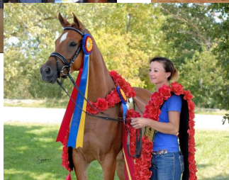
Left and above right: Angelfyre BWF, two championships at 2019 Sport Horse Nationals in Training Level Jr Horse and Training Level Open. Along with numerous Top Tens. Above middle: Nazareth CF, Reserve Champion in Arabian Hunter Pleasure Jr Horse at the Scottsdale Show